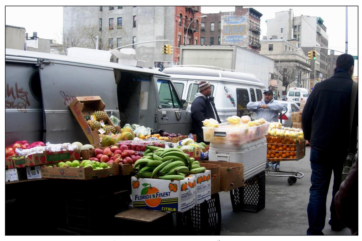
A familiar scene - Street Vendor at 149<sup>th</sup> and Grand Concourse.

communities at large." As part of their service learning, students sent to those interviewed the findings of their research. In the process, they grew more interested in and sympathetic toward vendors, less apprehensive to patronize them, and more understanding of the types of challenges that they face. They also came to understand how vendors may benefit society, and that they celebrate, by virtue of the various foods they sell, ethnicity and immigration. All this while learning to acquire the skills needed to write research papers!