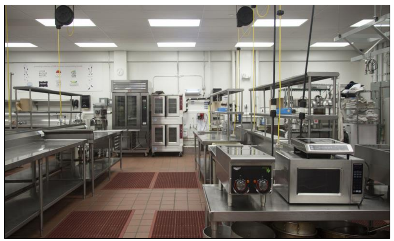
In the picture you can see part of the facilities of Hot Bread Kitchen incubates, which offers a commercial kitchen that serves as a business incubator for food businesses.