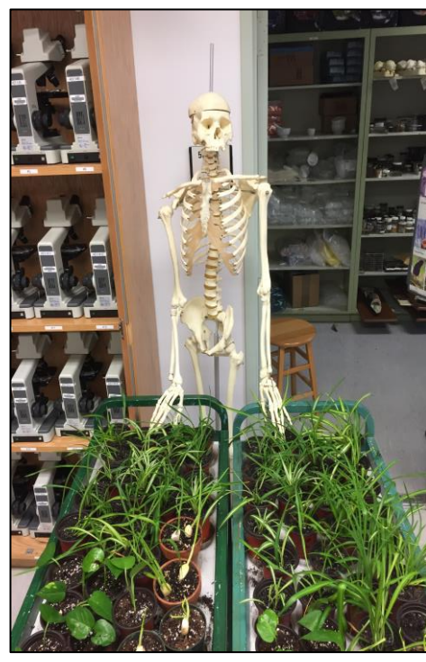
New plants propagated by BIO131 Plants and Society students

is a tangible product at the end of the exercise, but because the students learn about a very important biological concept. Hands-on interactions are memorable: they supplement students' education; they enhance the students' understanding of the role of plants in nature and our lives; and they enrich the students' formation as citizens of the world.