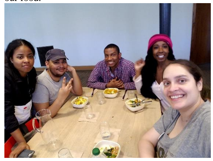
Sharing food with new friends.

Going to Stone Barns was an experience I will never forget. I met other students who had similar gardening interests. One of the moments that stuck out for me was when we all worked as a group in the kitchen. We broke into groups of 3 or 4 and received instructions to work on a particular ingredient. That experience reminded me of the ecosystem and of how the workers at Stone Barns have made the farm a niche for themselves, where one thing cannot work without the other parts. Although we all just met on the day of the trip, we had to trust each other with the preparation of our food.