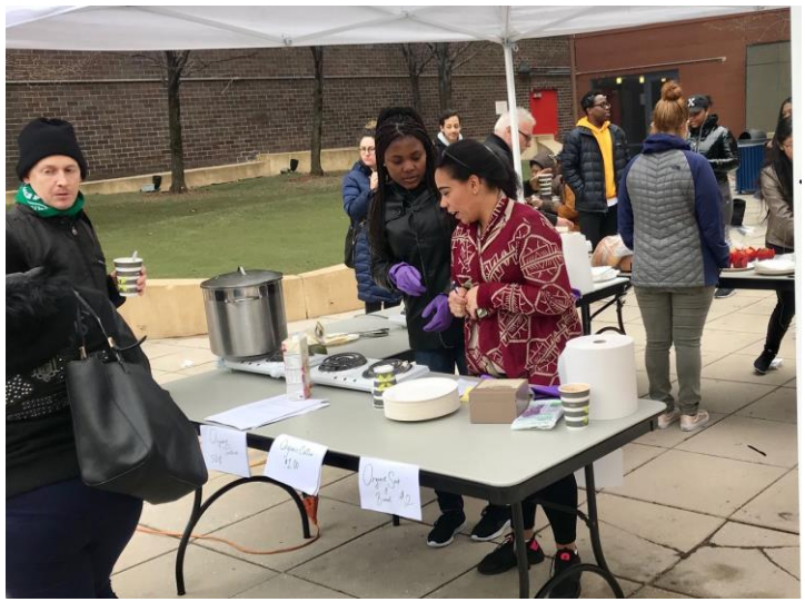
The Souper Market at Hostos Memorial Garden.