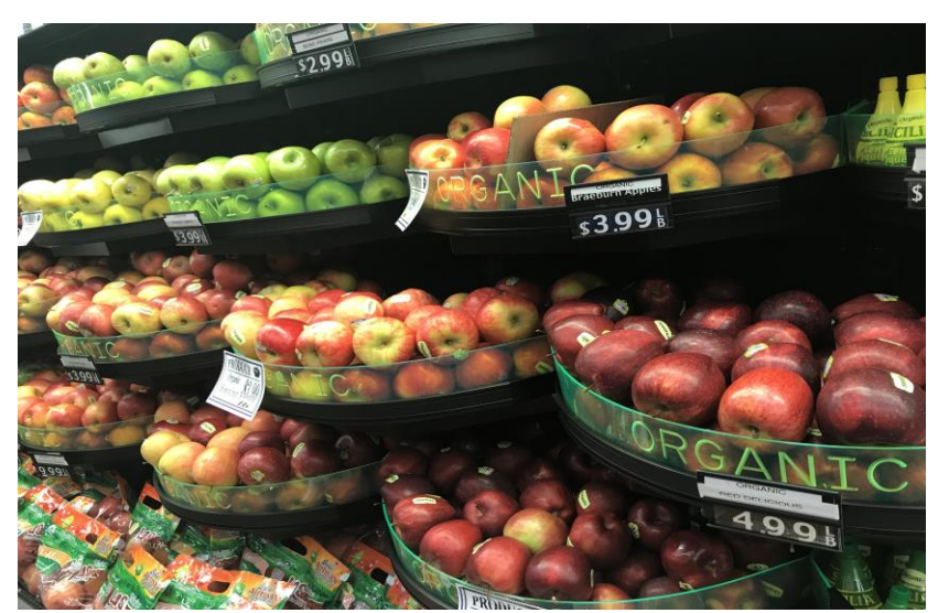
We must recognize that individuals possess multiple identities that all contribute to their food access, ethics, choice, and preparation.

Food Studies must be intersectional as well as interdisciplinary. We should study not only how food contributes to an individual's identities communities, but also how food contributes to systems of oppression and inequality experienced by those identities and communities. We must examine how access to food and systematic oppression are highly interconnected, which requires an intersectional approach. We must recognize that individuals possess multiple identities that all contribute to their food access, ethics, choice, and preparation. We must realize that this field is intrinsically politicized, as food issues directly intersect with issues such as labor rights, racial justice, economic inequality, environmental justice, sustainability, and more.