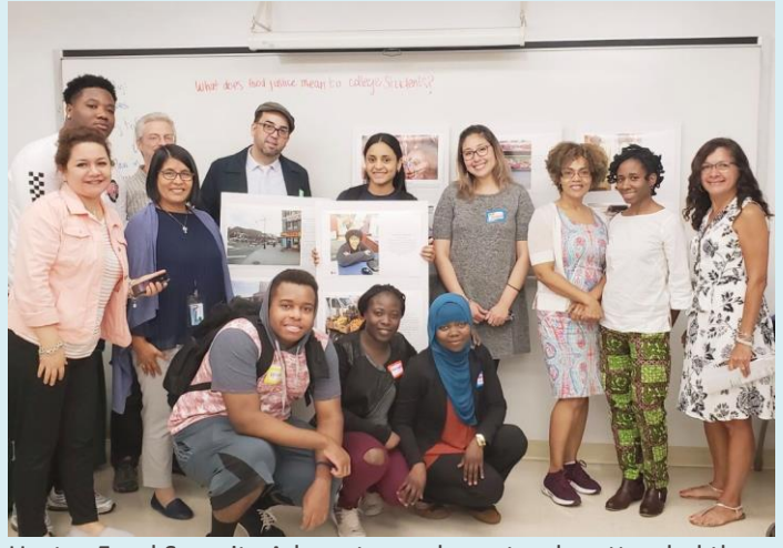
Hostos Food Security Advocates and guests who attended the May 2^{\text{nd}} event.