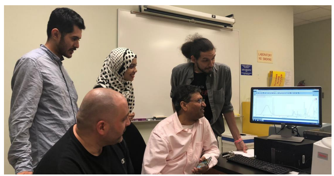
Students are analyzing their results at IR Spectrophotometer.