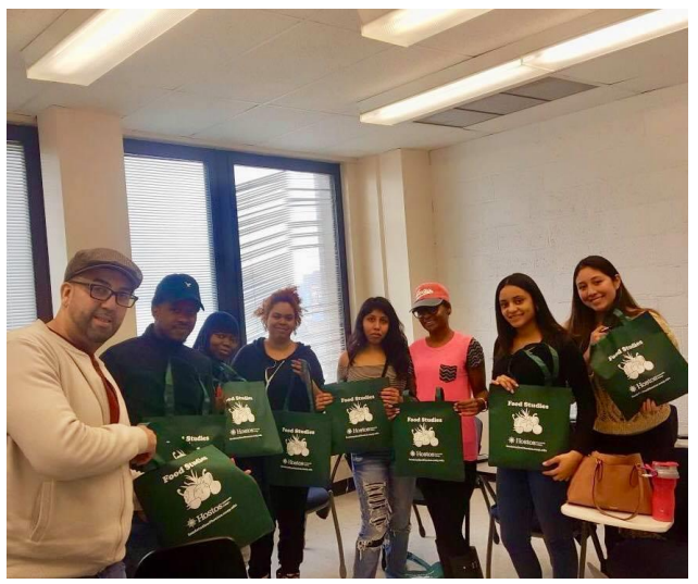
The official initiation of the club, spring 2018.

Sixty-six thousand students at CUNY experience hunger, which unfortunately goes unnoticed. Some students do not have the means to sustain themselves financially. Many struggle to keep a roof over their heads, while others simply are not familiar with the system. We all live in America, the land of opportunity where food should be free for all. But that is not always the case.