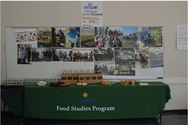
End of the semester celebration.