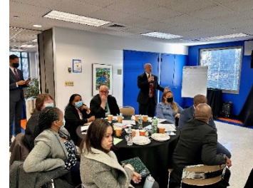
Nursing Department faculty

The value of such a convening cannot be understated: bringing stakeholders together provides opportunities to strengthen programs and pathways to employment. It creates an organic space in which stakeholders listen and make connections on a human scale that lead to improved opportunities for students.