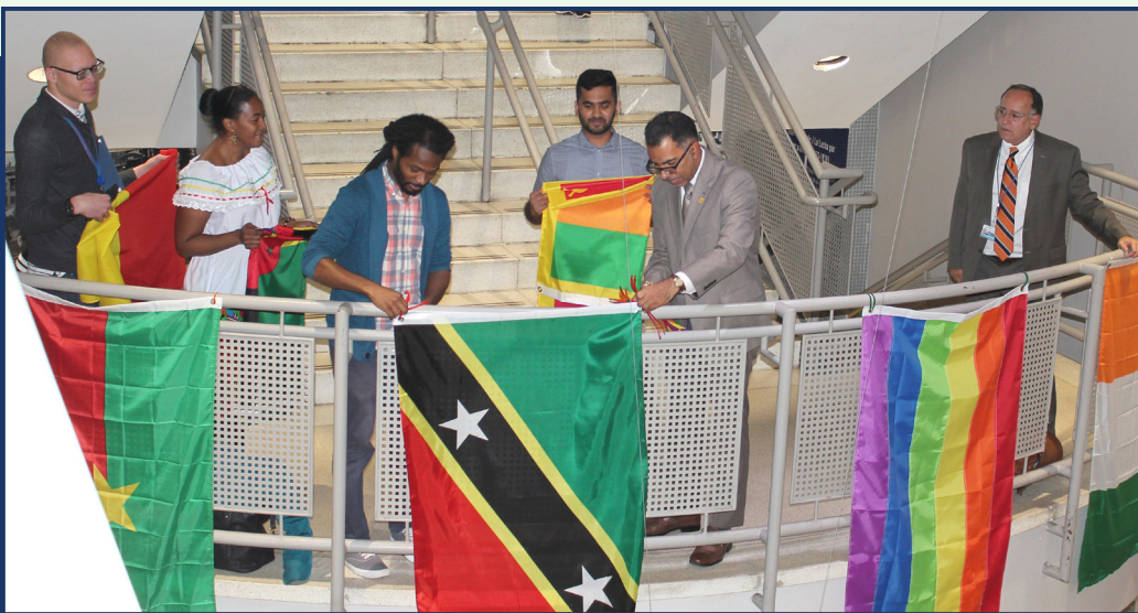
SDEM promotes diversity and global awareness