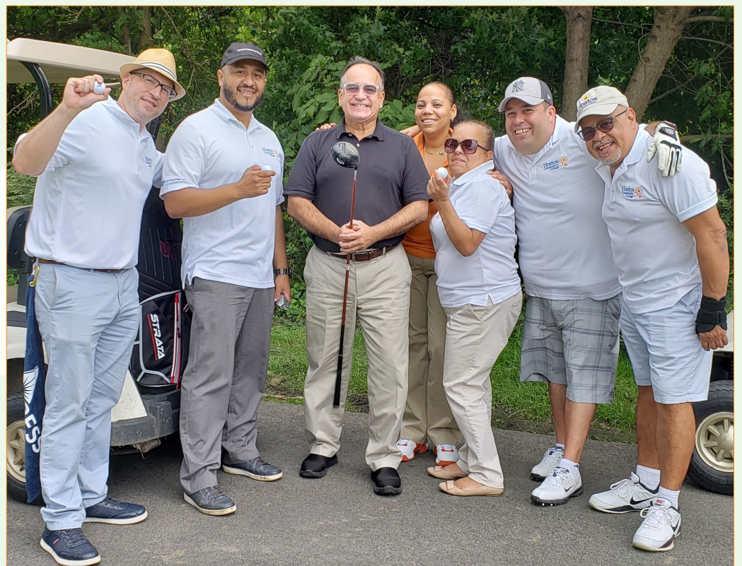
SDEM helps raise funds for student scholarships

On Friday, September 21, seven members of the SDEM team teed up in support of the 12th Annual Scholarship Fund Golf Outing Classic which raised a record-shattering $104,690.