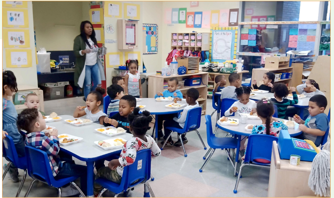
SDEM promotes access to Hostos staff

Hostos Children's Center understands the importance of child care in the workplace. For instance, it supports increased employee retention, improved performance, greater connection to the job, and better timeliness and attendance. Therefore, Hostos Community College Children's Center, Inc. has opened their doors to serving the children of faculty & staff. Children of Hostos Community College faculty & staff, who are residents of New York City, can enroll their child in the free Pre-K for All (age 4) or 3k for All (age 3) programs via NYC Department of Education. Limited seats are available for children age 2.